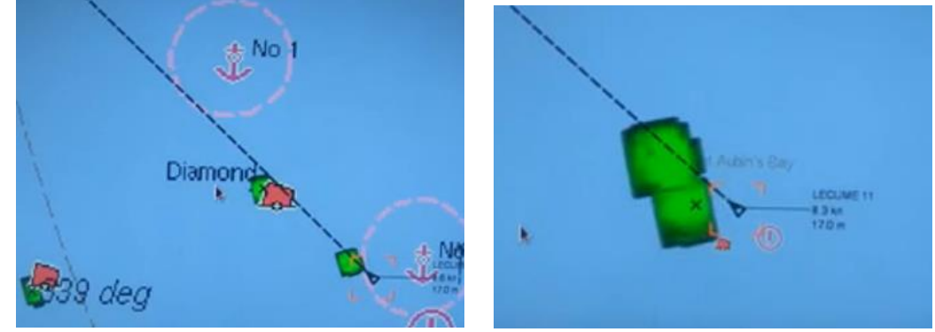
FIG 22 & 23 L'ECUME II leaves Diamond Buoy to port