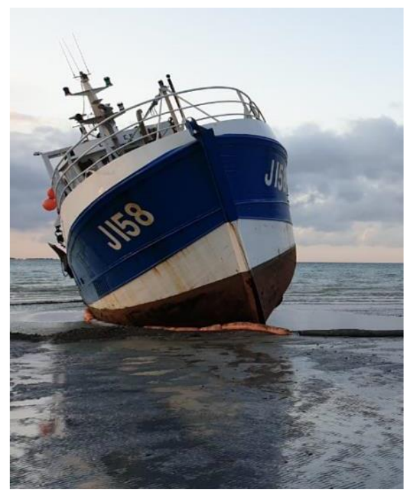
FIG 3 – L'Ecume II starboard Bow