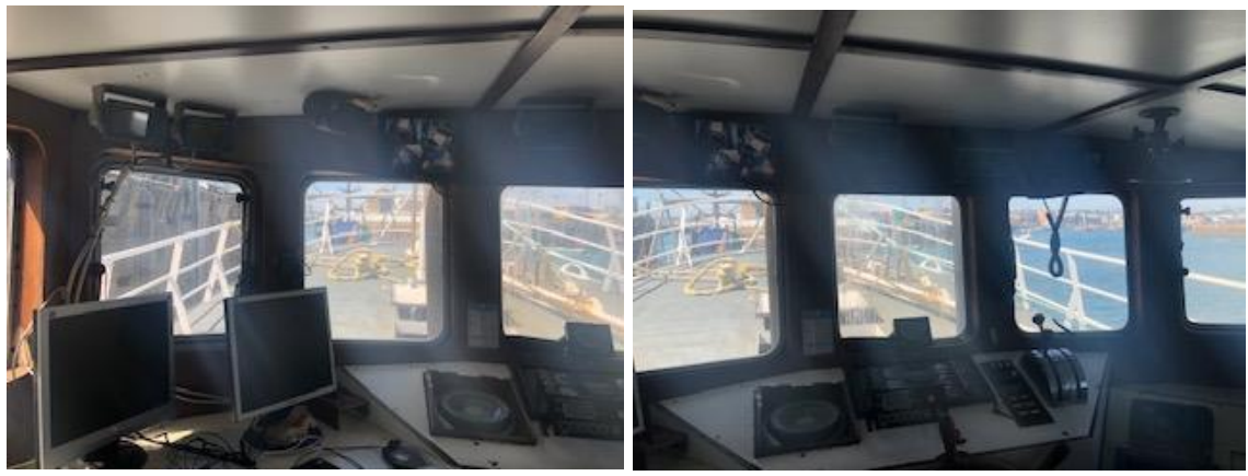
FIG 12 & 13 Bridge equipment layout from the conning position