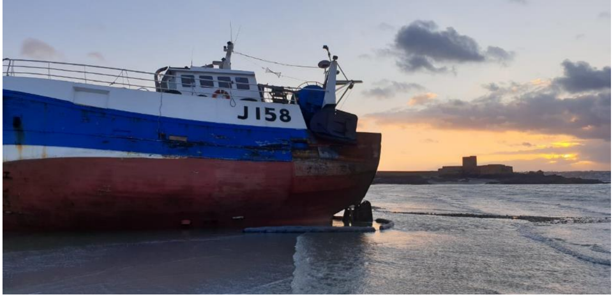
FIG 9 - L'ECUME II Port side.