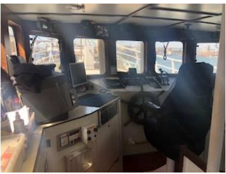
FIG 11 – L'Ecume II wheelhouse from Port Aft