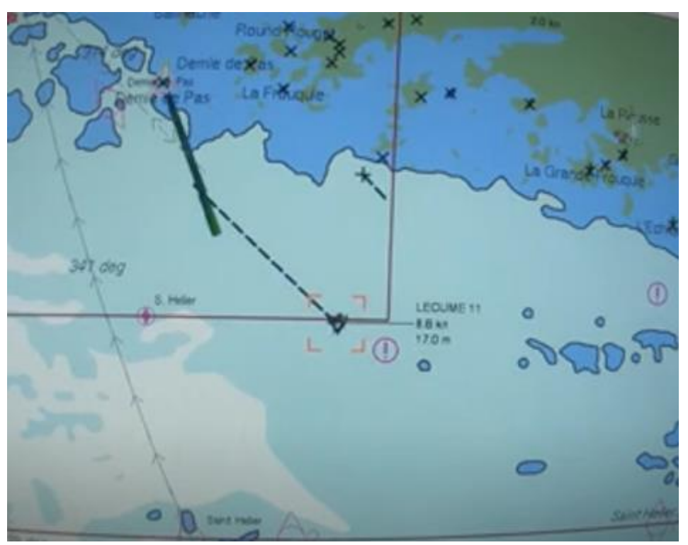
FIG 16 – L'ECUME II approches Demie De Pas (VTS screenshot)