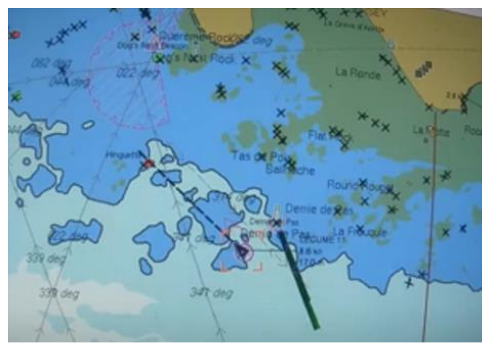
FIG 17 L'ECUME II passes Demie de Pas (VTS screenshot)