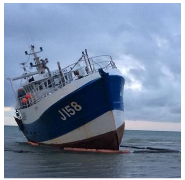
FIG 2 – L'ECUME II, aground with pollution control boom in place.