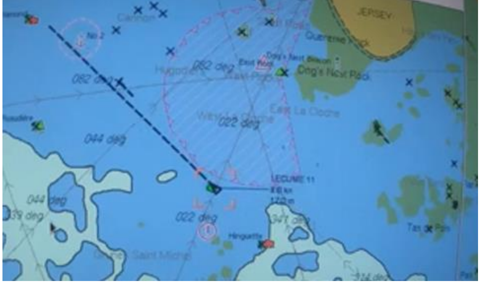
FIG 20 L'ECUME II, skirting the precautionary area, crosses leading lights on Small Roads for St Helier Entrance