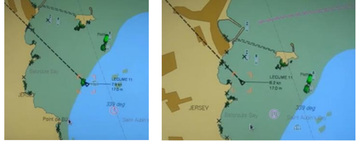
FIG 24 & 25 L'ECUME II having passed south of the outlying rocks crosses the Om sounding and then runs aground at 8 knots.