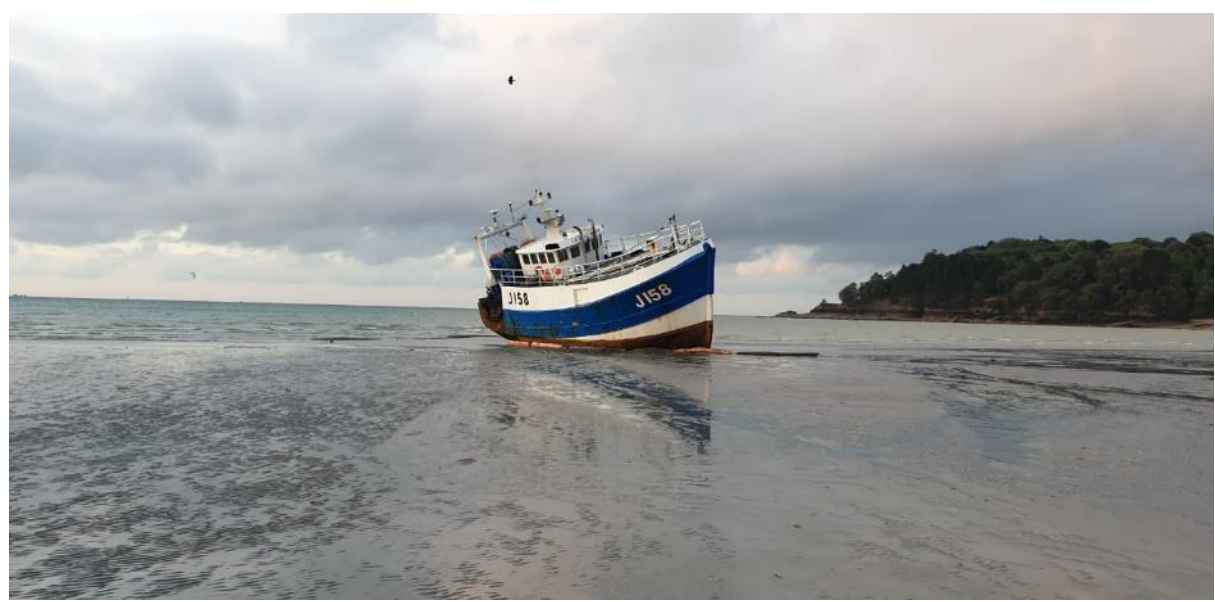
FIG 5 – L'ECUME II Starboard bow