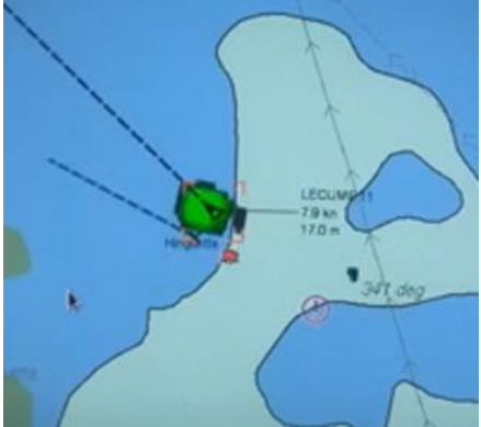
FIG 18 & 19 L'ECUME II leaves Hinguette Buoy to port