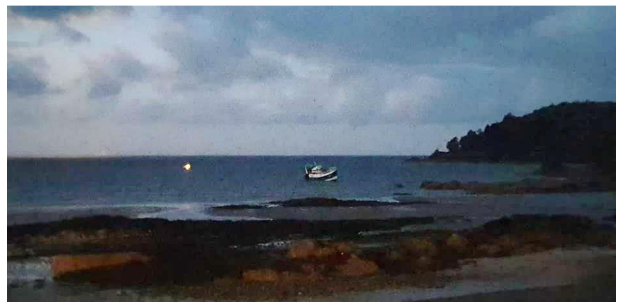
FIG 1 – L'ECUME II aground in Belcroute Bay