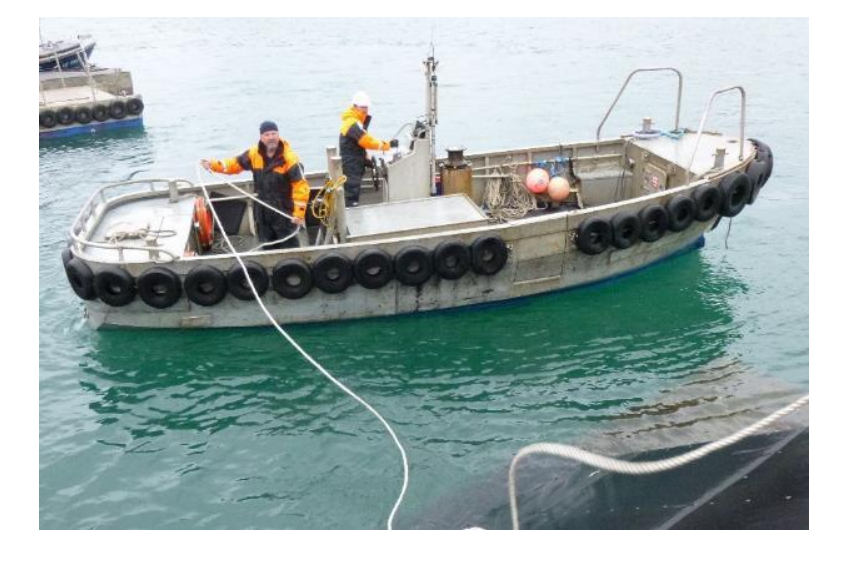
Fig 26: Harbour workboat Halcyon which assisted with re-floating L'ECUME II