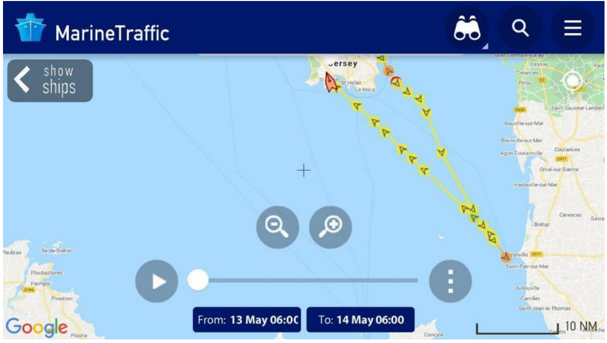
FIG 15 – L'Ecume II AIS Track (download from Marine Traffic)