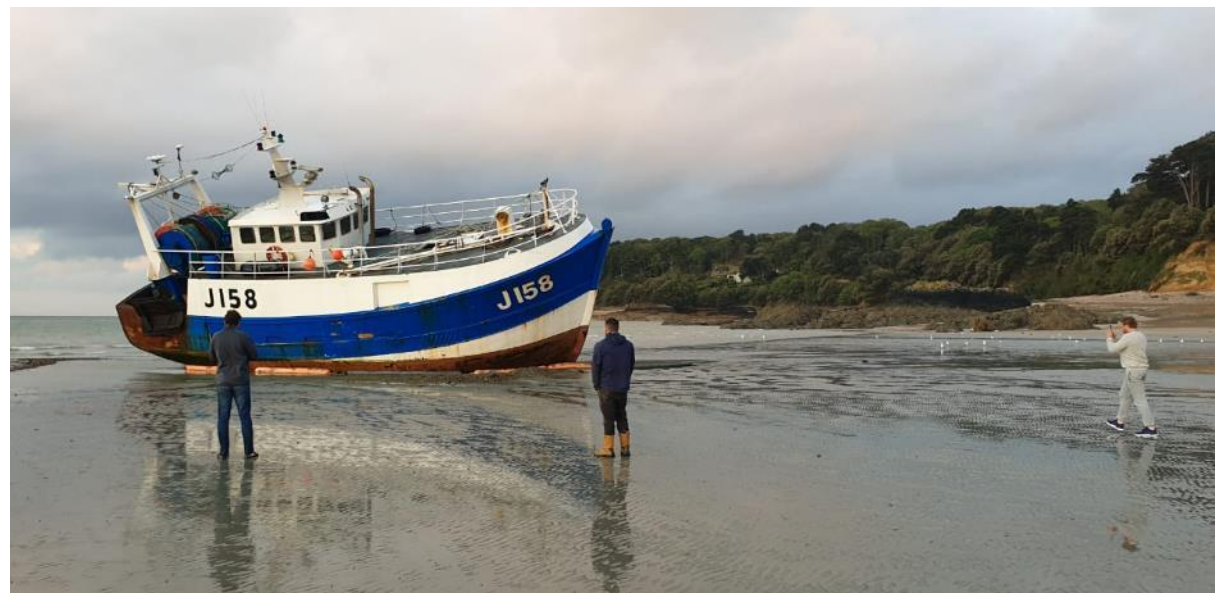
Fig 6 – L'ECUME II Starboard side