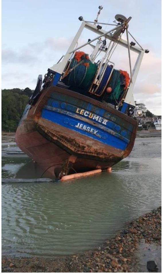
FIG 4 L'Ecume II from astern