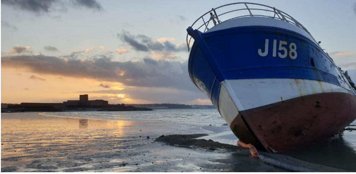
FIG 8 – L'ECUME II Port Bow