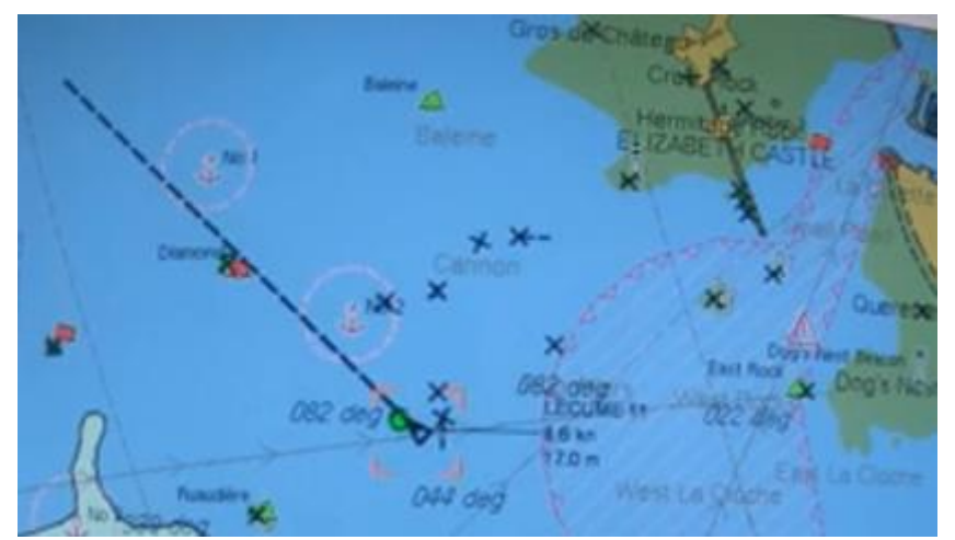
FIG 21 L'ECUME II crosses Western Passage Leads for turn to west (heading towards Diamond buoy)