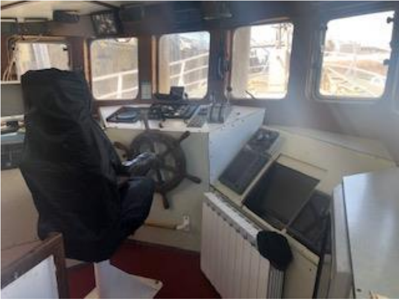
FIG 10 – L'Ecume II wheelhouse looking forward